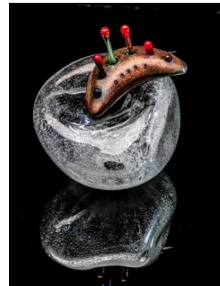
Nudibranch on blown glass reef

I make wearable and non-wearable sculptures in glass and metal. My work is inspired by the coral reef. Working in glass enables me to reflect both on the beauty and the fragility of the reef.